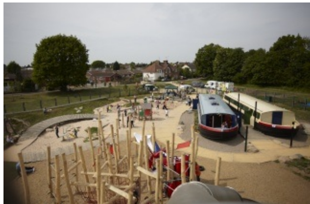
Wisbech Adventure Playground. Courtesy: Sutcliffe Play (main contractor and designer) and Snug & Outdoor (additional play and design)