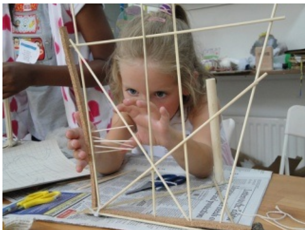
Adventures in 3 Dimensions.

http://www.buildingexploratory.org.uk/resources/#adventure (accessed 18 March 2013).