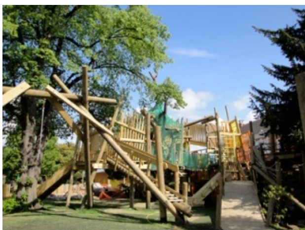
Kilburn Grange Park Adventure Playground.